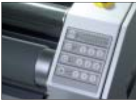
Touch-pad control with predefined settings for temperature, speed and substrate thickness.