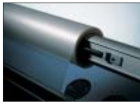
Swing-out supply shafts with unique auto-grip for easy loading and positioning of materials.